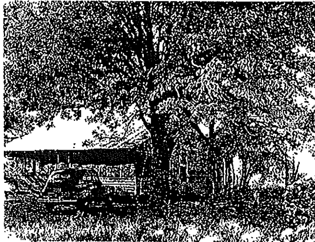
Wright Home - Circa 1955